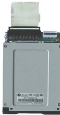
PATA / IDE